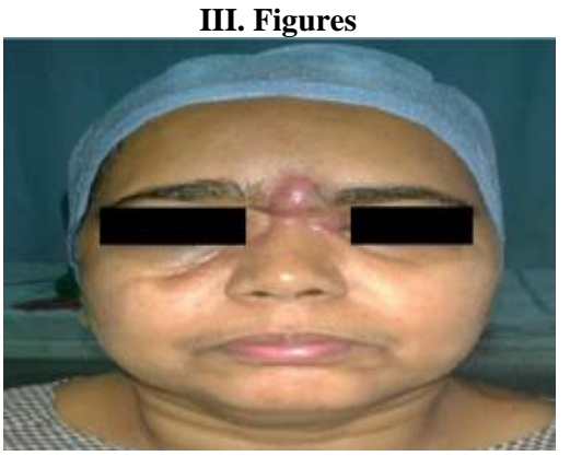
Fig 1: Midline Forehead Swelling.

The patient has improved cosmetically, along with medical management consisting of immunomodulatory drug, Thalidomide. She has no further complaints.