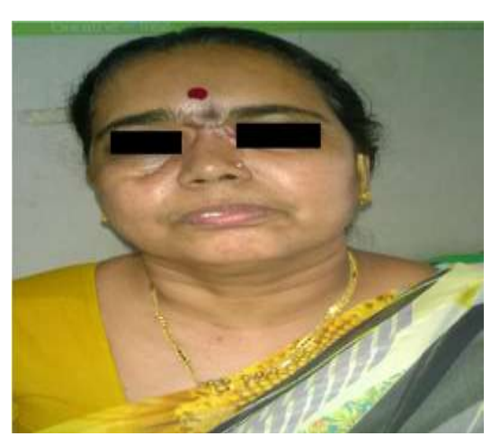
Fig 3: Postoperative photo of 3 months showing no recurrence of swelling.